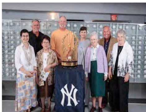
Sisters and celebrities