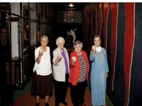
All Star Sisters